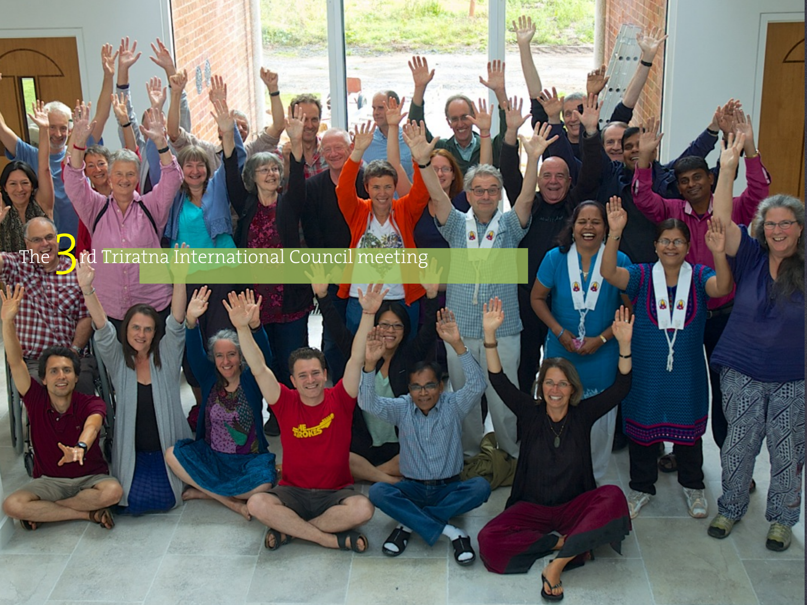
The 3 rd Triratna International Council meeting