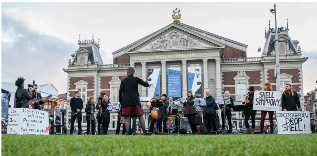
Music action (Oct 5th, 2017) 'Drop Shell sponsorship' Royal Concertgebouw, Amsterdam.

We can shift public support away from the fossil fuel industry by pressuring our public institutions to break the sponsorship ties they have with many fossil fuel companies.